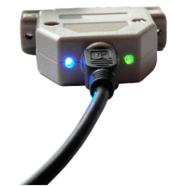
The 2 LEDs on the backshell of the UC100 controller.